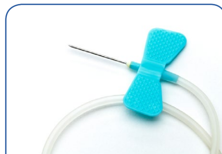
IV MINI SETS